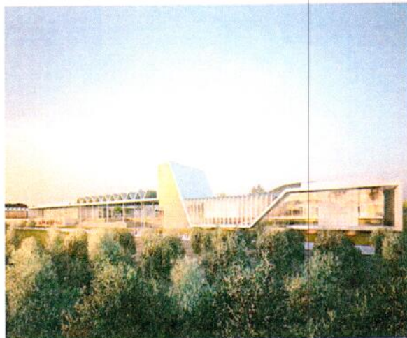
The projected UEMF campus

In this context, the Euro-Mediterranean University of Fes ( Université Euro-Méditerranéenne de Fès , UEMF) stands as a new regional centre of excellence contributing to regional stability and integration through the promotion of dialogue, intercultural exchange, sharing of knowledge and cooperation in the fields of higher education, research and innovation. Its particular regional approach is reflected in the diversity of nationalities of the students and staff as well as in the contents of study programmes, which focus on important topics for the integrated development of the Mediterranean region.