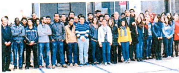
Students currently enrolled at the UEMF