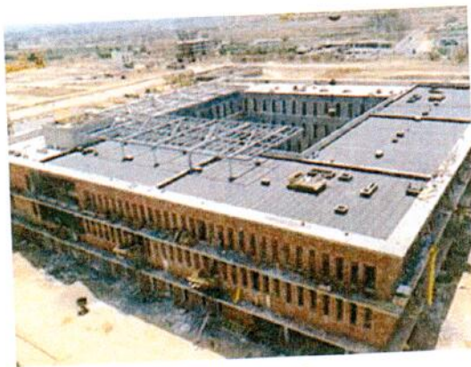
The UEMF grounds

The UEMF concluded a cooperation agreement with the Institut du Monde Arabe (IMA) with the objective of jointly participating at international research projects, fostering student and researcher mobility, co-organizing cultural and scientific events and offering Arabic courses.